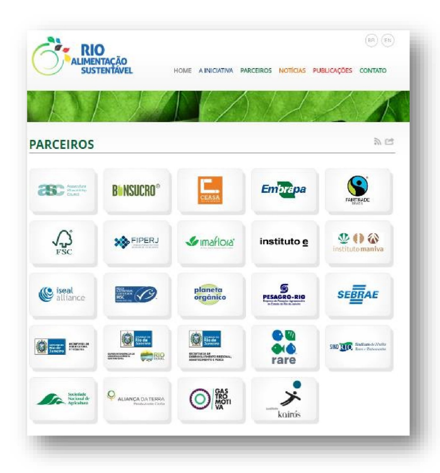
Figure 1: Rio Sustainable Food Initiative website, page of partners (<a href="http://rio-alimentacaosustentavel.org.br/site/parceiros/">http://rio-alimentacaosustentavel.org.br/site/parceiros/</a>)

We can say that during the 2016 Olympic Games, almost no food with traceable origin was consumed.