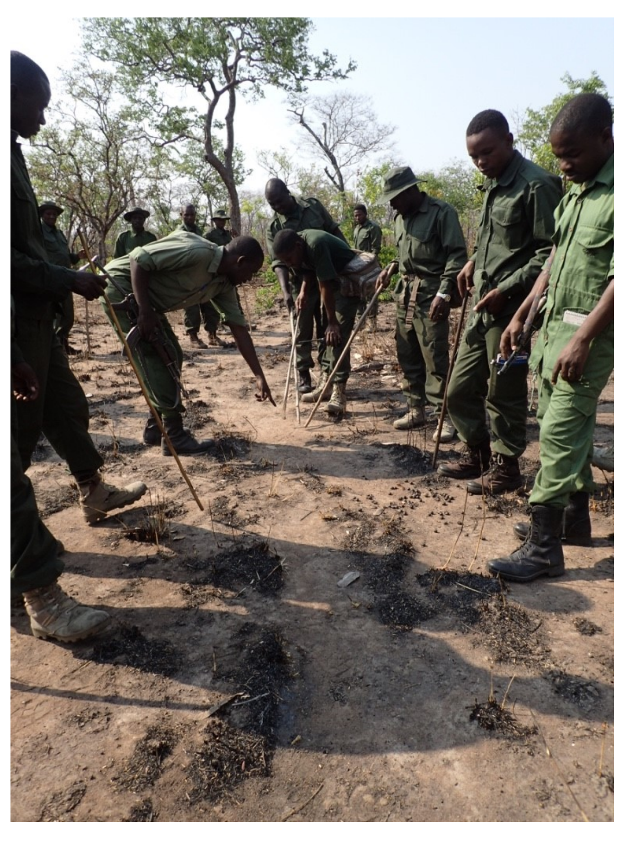
Rangers from Ugalla Game Reserve receive training in tracking in September 2015.