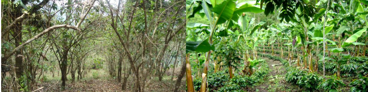
Low productive coffee farm in Mexico

The baseline survey to determine carbon footprint by using the Cool Farm Tool, showed us very relevant data: about 80% of GHG emissions generated during the production of coffee in 81 sample plots originate in wastewater produced during the wet processing of coffee. Therefore, work on this activity is essential to reduce emissions. However, the situation faced by coffee producers, because the old plantations, low productivity affected by rust (Hemileia vastatrix) in the last three years, the lack of training of producers to meet this problem and lack of technical assistance have caused producers have focused on the activities of improving productivity as priority activities in order to improve their income under the production system CSA helps prevent the spread of the areas to natural areas (deforestation). It is noteworthy that the coffee is a perennial crop and requires management practices and crop improvement based on plant phenology, therefore the training topics to develop must correspond to the phenological stage of the coffee plantation. Also, one of the strategies used to adapt the cultivation of coffee to climate change is the introduction of resistant varieties. This strategy will promote crop resilience of changes in temperature and precipitation. But unawareness of the producers on the benefits of these varieties makes the process of adoption is slow.