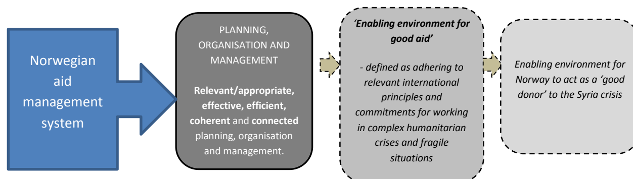
Figure 1; Logic model for evaluation of Norway's support to the Syria crisis