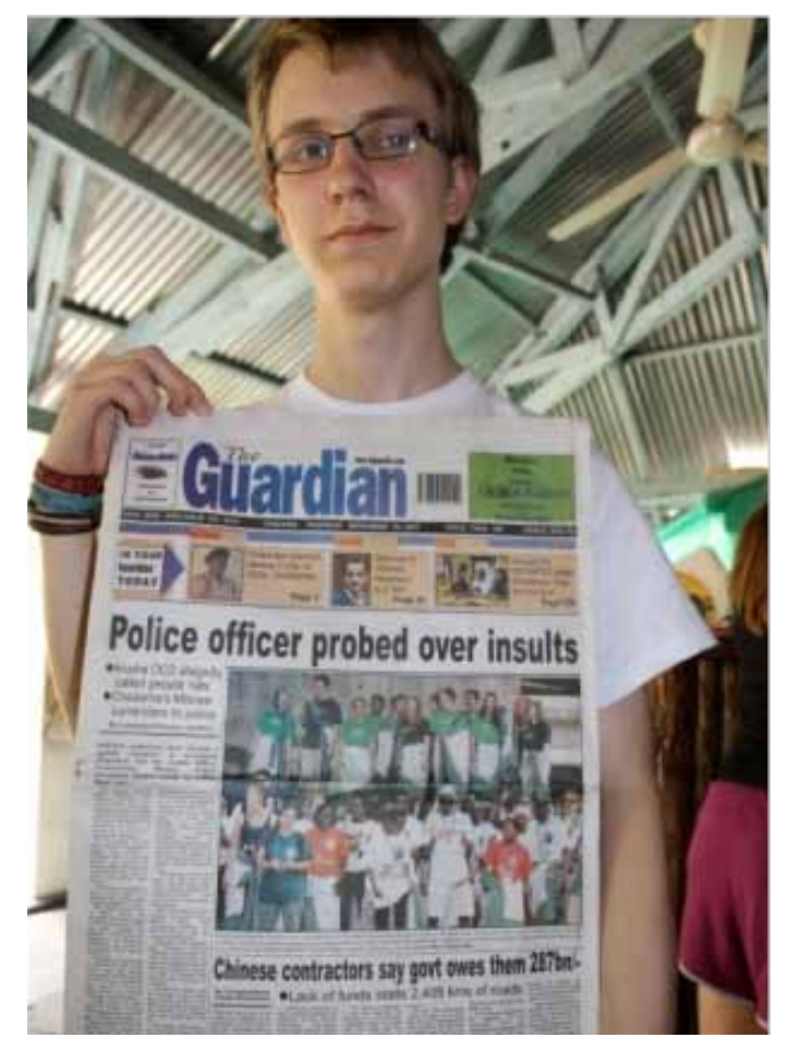
The Climate Justice concert in Dar es Salaam on the front page of The Guardian.

From South Africa it was estimated that the value of the media coverage was ZAR 6 million<sup>1</sup> as the campaign achieved coverage in almost every major South African newspaper, radio station and TV channel, in some cases repeatedly. In Zambia the concert was broadcasted by the Zambia National Broadcast. Moreover, prior to the youth caravan, the youth caravan team appeared in two live radio interviews on Radio Christian Voice, a channel that has national coverage, in addition to appear on a national TV show.