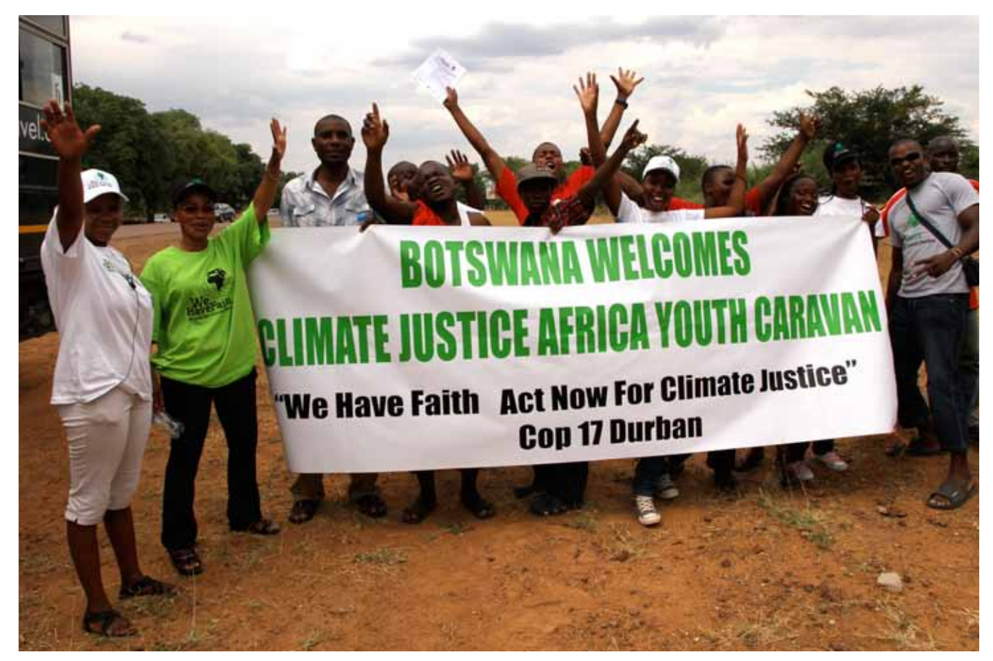
The Climate Caravan gets a warm welcome in Botswana.

AYICC - Africa Youth Initiative on Climate Change COP - Conference of the Parties KYCN - Kenya Youth Climate Network SAFCEI - Southern African Faith Communities' Environment Institute CfC - Communication for Change CCZ - Council of Churches in Zambia EJN - Economic Justice Network FK - Fredskorpset, Norwegian programme for international exchange of young professionals NCA - Norwegian Church Aid HO - Head Office CA - Christian Aid DCA - DanChurchAid UNFCCC - United Nations Framework Convention on Climate Change VICOBA - Village Community Banks