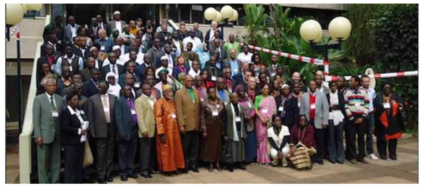
Religious leaders at the Pan African Conference in Nairobi, Kenya.

Our ways of thinking and feeling deeply influence the world around us. As we find compassion, peace and harmony within ourselves, we will begin to treat the Earth with respect, resist disorder and live in peace with each other, including embracing a binding climate treaty. We pray that compassion will guide these negotiations.