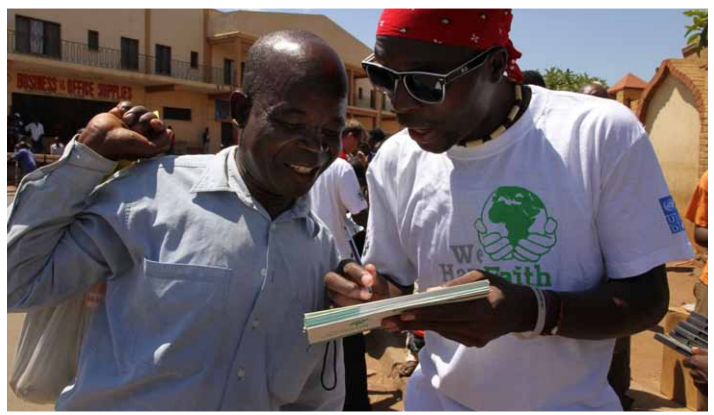
Signing of the petition.

For future campaigns it is hoped that the HO has a role of seeing the bigger picture and holding the reigns when it comes to including other APRODEV agencies and global and European networks and sister agencies.