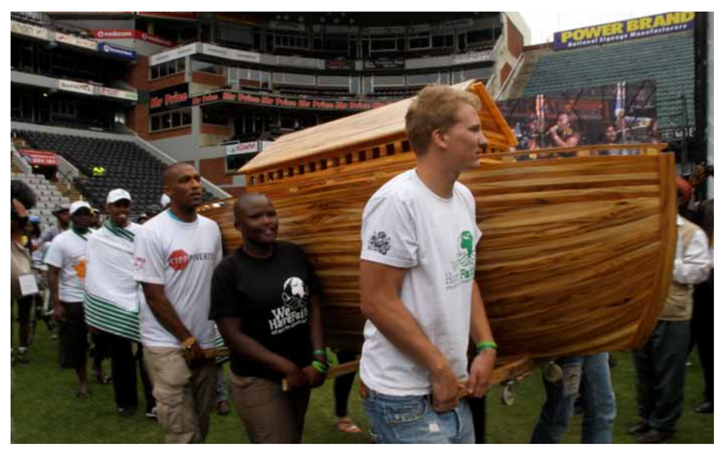
Noah's Ark, carrying the 200 000 signatures collected during the campaign.

Nonetheless, having Desmond Tutu hosting the Interfaith Rally along with other prominent guests gave national and international media attention with 150 media accreditations granted. Present at the stadium were CNN, BBC, TV5 and Al Jazeera.