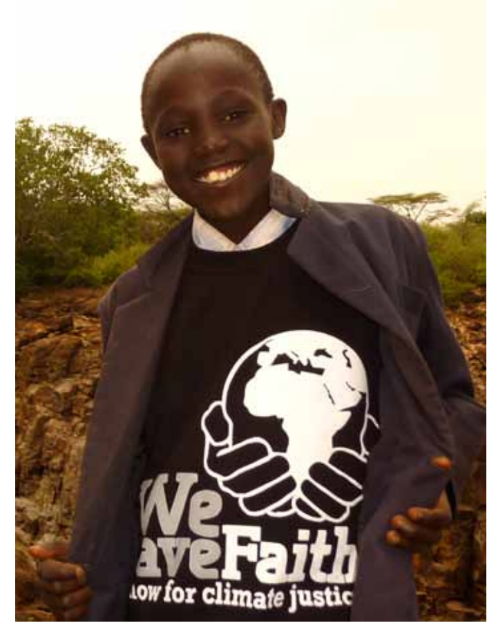
"We have faith."

The 27th of November 2011, Archbishop Emeritus of Cape Town, the Most Reverend Desmond Tutu, handed over 200 000 signatures collected throughout the African continent to Ms. Christiana Figueres, Executive Secretary of the United Nations Convention on Climate Change, as well as the COP Presidency headed by the SA Foreign Affairs Minister Maite Nkoana-Mashabane. The following chapters give a short overview of the main achievements.