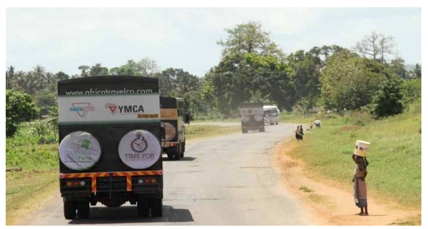
The caravan drove through 6 African countries in November 2011.

"I never thought I could represent my country in the negotiations as a youth during COP 17, but through the mobilization efforts made through the caravan, I was selected to join as a Party delegate and the impact was immense in building my capacity – for example contributing to the negotiation text on youth participation in capacity building." (David Wainaina Kuria, 25 years old from Kenya).