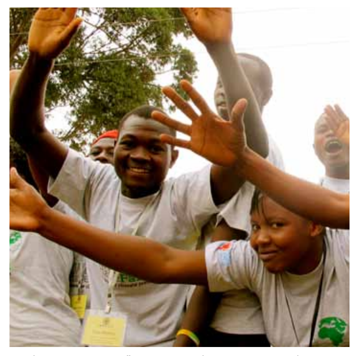
Youth partizipating in "We Have Faith - Act Now For Climte Justice."

For future campaigns it has also been discussed whether we should aim for a political demand and a change. As mentioned in the introduction to this report, the purpose of the "We Have Faith" campaign was not to change the outcome of COP 17, but rather to create a platform that had the potential to influence the process. If a new campaign takes wisdom from the learning points of "We Have Faith" an objective could be to have results also on the outcome level.