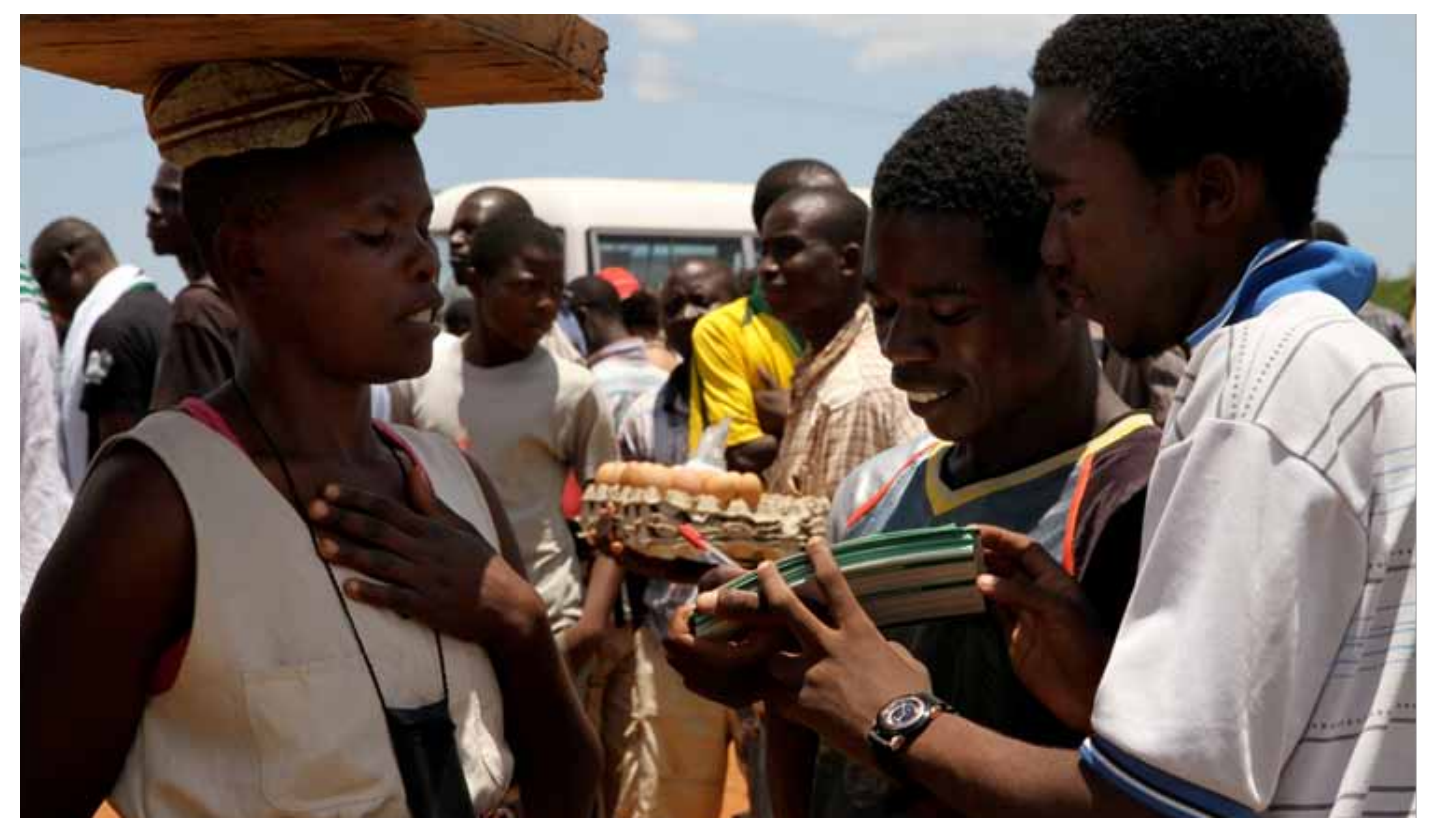
Youth from the Climate Caravan collecting signatures in Malawi.

The participating parties in South Africa evaluated the dynamic in the team as very successful. Bishop Geoff Davies