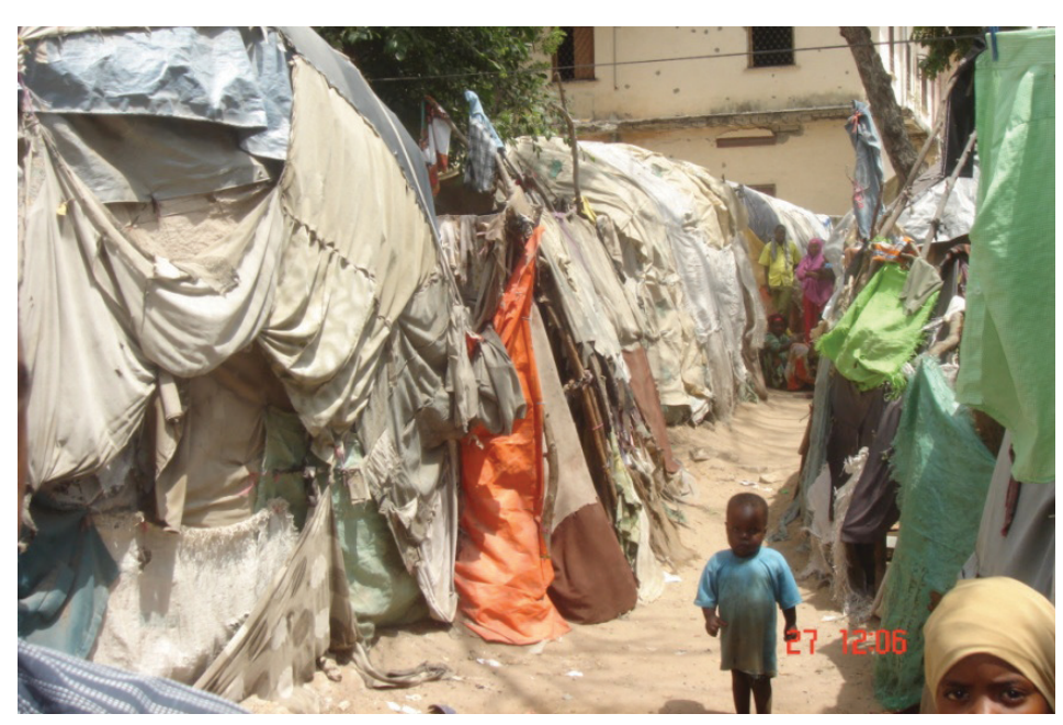
Figure 12: A crowded IDP settlement in central Mogadishu where NRC plastic sheets complement traditional buuls