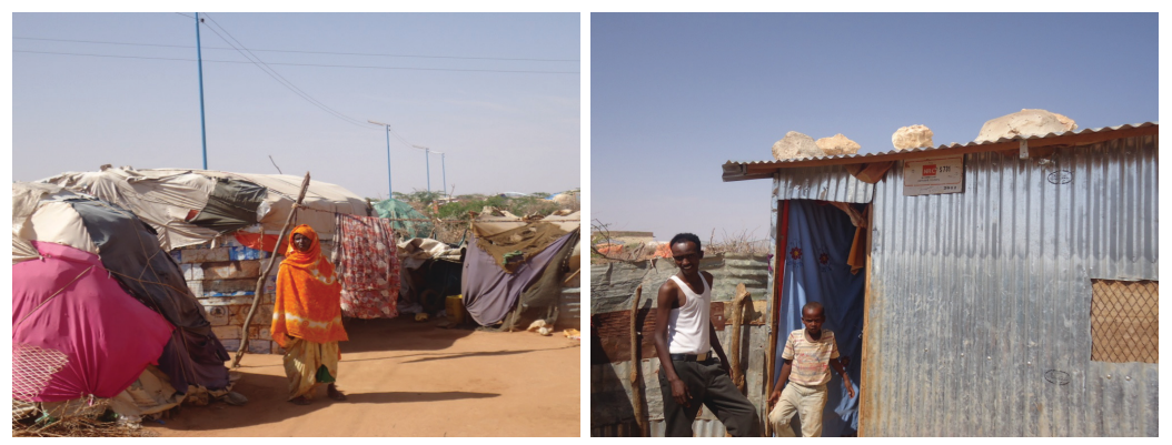
Figure 4: Traditional shelter (Tukus) and Improved Semi-Permanent shelter at Aden Suleiman camp in Burao, Somalia

The team found that the NRC support systems, including procurement, management, local adaptation of operating procedures, physical verifications of deliveries and checks and balances in distribution functioned well. There remained challenges related to post distribution monitoring. Only some of these were related to security and gender.