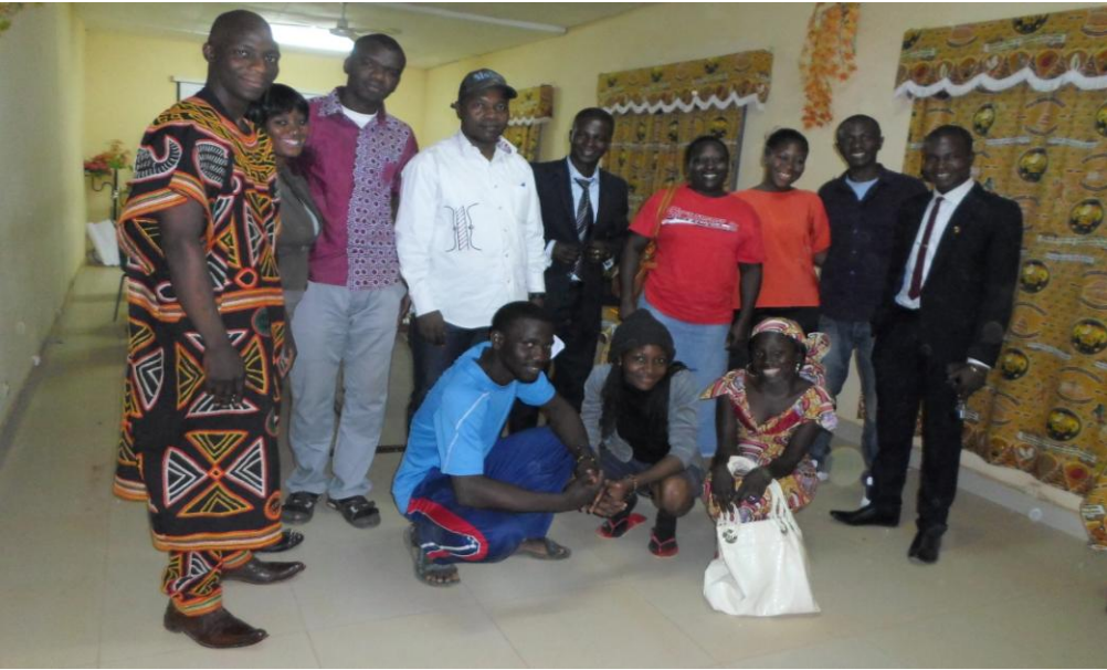
Youth members of the mobile caravan posing for a photo after a focus group discussion 35

There is evidence of sensitization activities having been carried out in various parts of the project sites. The sensitization were well organized and targeted communities including youth in and out of school, university students, church leaders - women, youth and pastors as well as members of the general public.