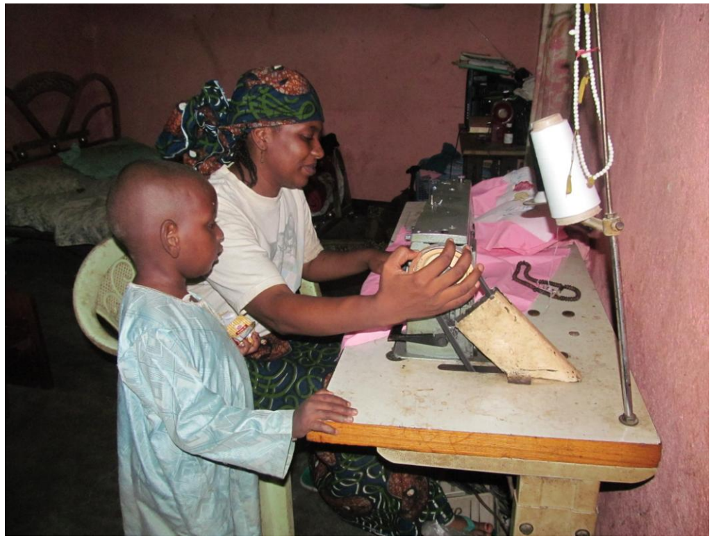
Photo of one of the support group leaders interviewed during the evaluation exercise

Leadership by PLWHA and in the management of support group in critical. This will not only support group members' activities; but also help them motivated to participate in local and national platforms on HIV&AIDS advocacy for health and other resource needs they may have. From evaluators observation during focus group discussions conducted with PLWHA leaders and association members, none of the support groups or its leadership had the capacity essential to help them move to the next level of independence of the group management. This remains a big challenge to the project and support groups' sustainability.