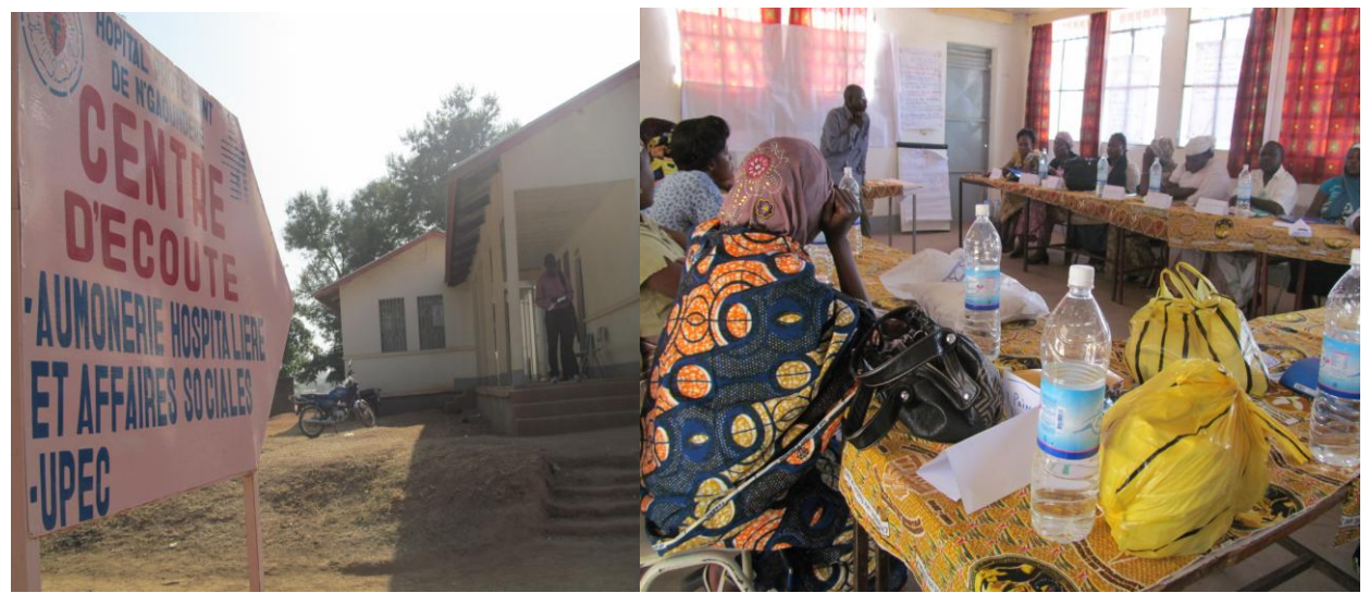
Photos of Centre de'coute and a training going on at the time of the evaluation

Other social services provided here include space for meetings mainly for PLWHA support groups/associations, seminars and trainings rooms for youth who were involved in the project, HIV&AIDS education; as well as meeting point for orphans and vulnerable children reached by the health department of the EELC. Centre is now fully operational and in good use as the picture taken during the evaluation period shows a seminar going on in the meeting room.