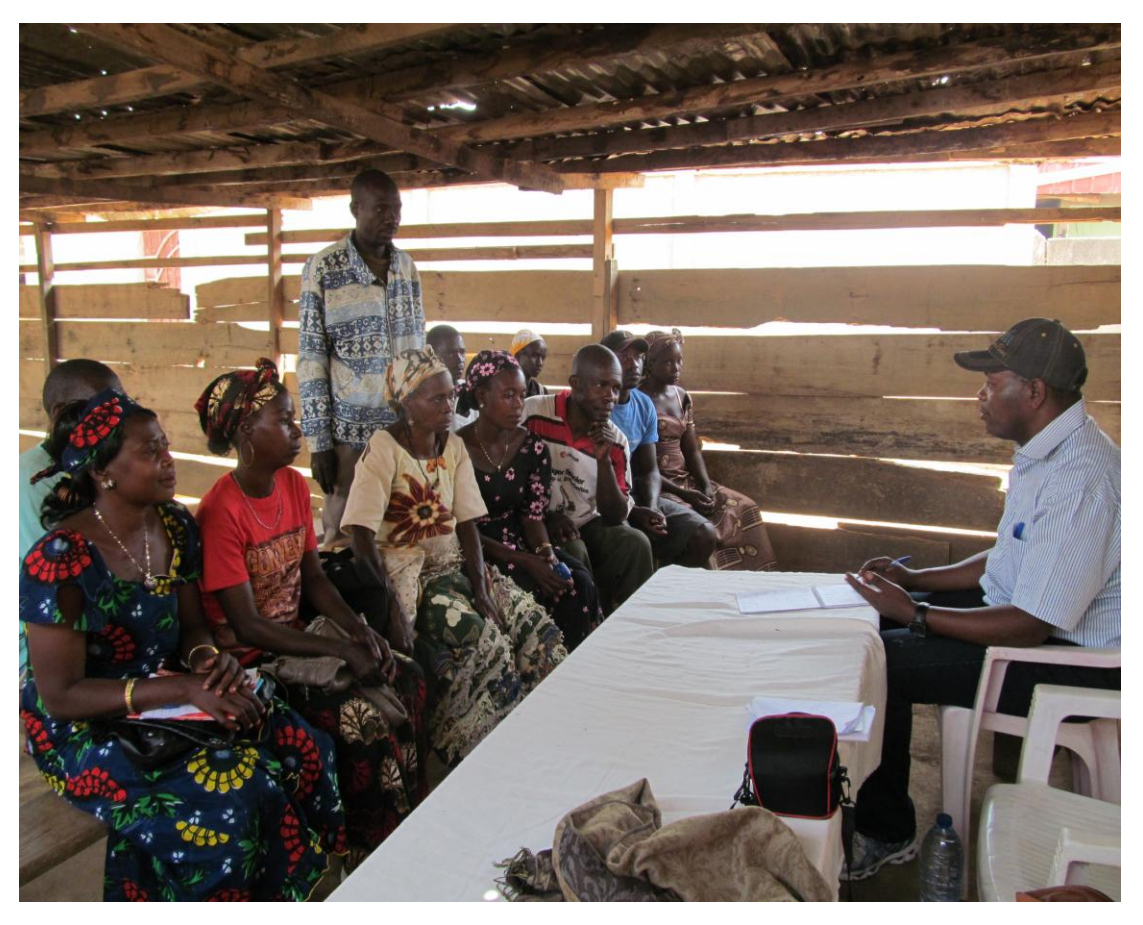
Members of a support group participating in focus group discussion during data collection in Bertoua

Most of the respondents reported to have received such trainings from the project while others have had such informal sessions in local health facilities and treatment Centers. Members of the youth mobile caravan reported to have been trained as trainers and imparted with knowledge about HIV&AIDS which they then went on to disseminate in various institutions of learning, churches and members of the public. It is therefore observed, that most project beneficiaries and community members have correct knowledge about HIV transmission and prevention measures.