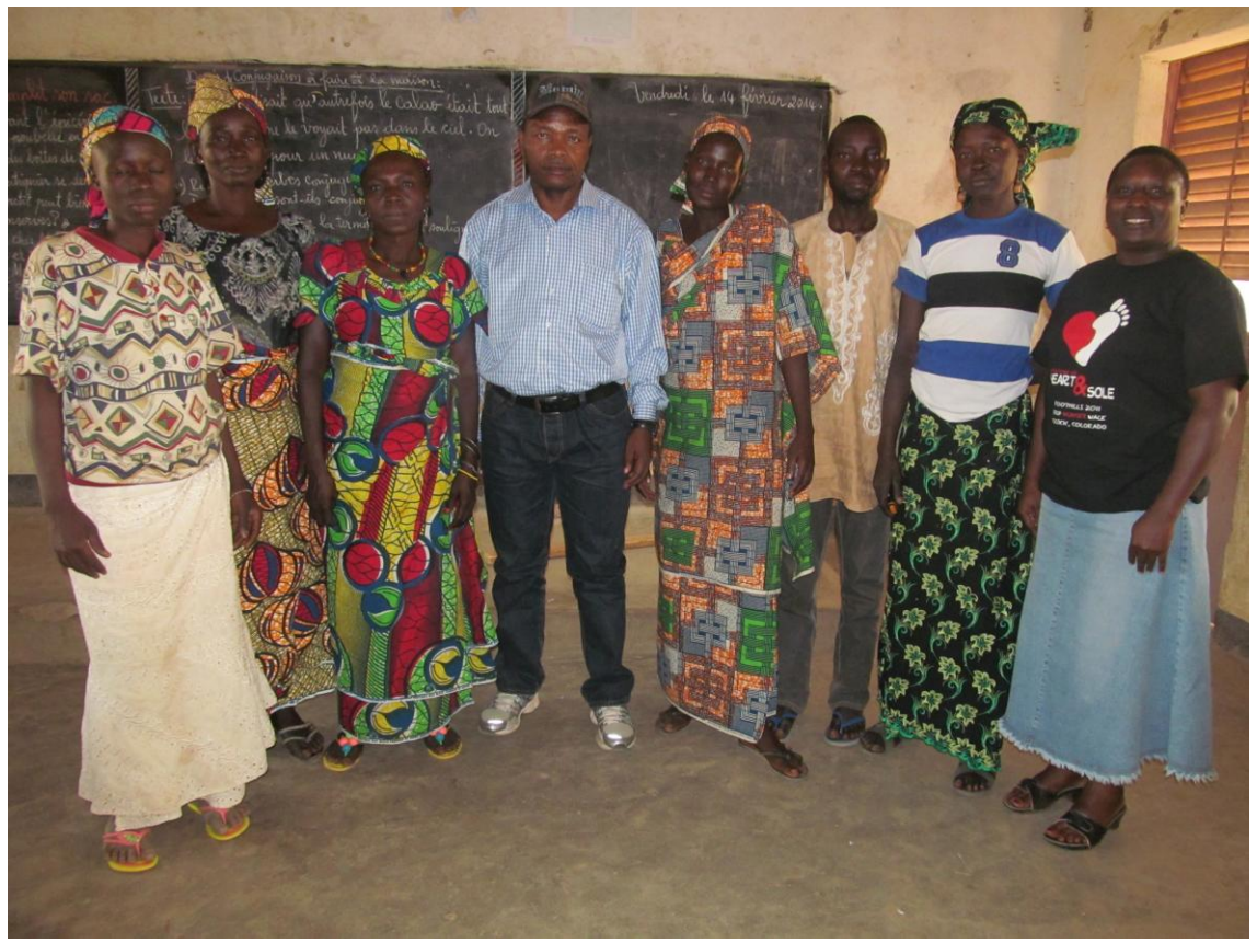
Group photo of members of support group and consultants in Tchollire after a focus group discussion

This observation was further confirmed by the mini-survey conducted with members of the public showing that the practice of condom use during sexual relationships is somewhat common in the area with 47(57%) participants indicating use; while 35(43%) said they do not use condoms. Findings of the mini-survey on the practice of condom use by location are shown in Table 16 below.