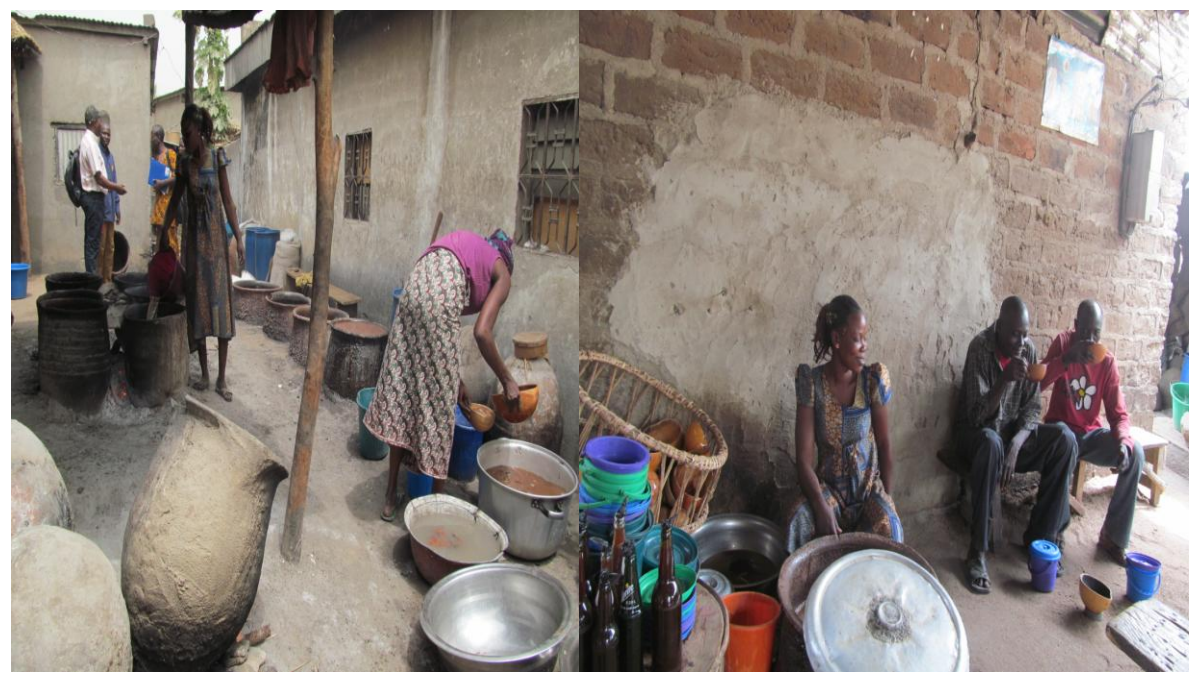
Photos: Local brewing and selling point as an income generating activity for one female support group member

dress making, jewellery and livestock keeping, and motorbike transport. Some of the business activities e.g brewing and selling of local beer (BiliBili- as known in the local language) could further expose the women to sexual violation by their clients; while those engaged in charcoal business are not promoting environmental conservation issues.