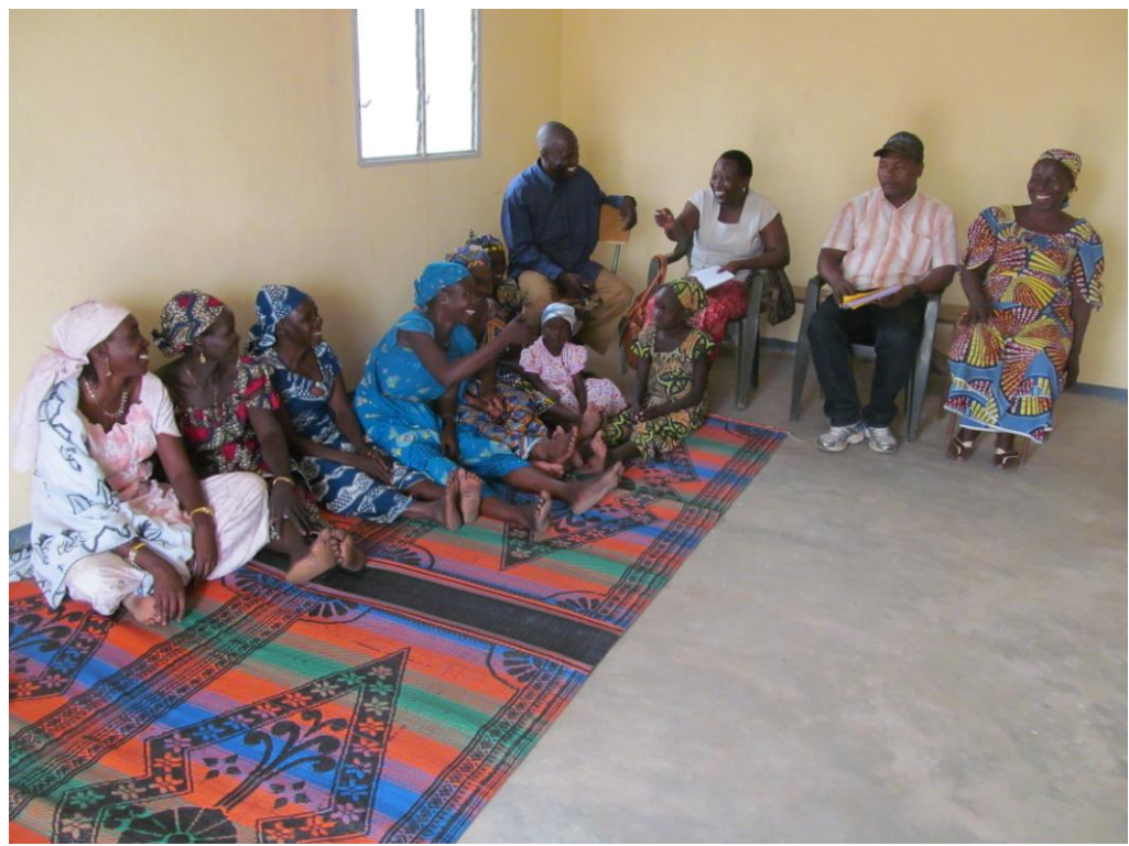
Members of the support group in Pitoa engaged in a focus group discussion with the consultants

Findings from the focus group discussions pointed to high level of illiteracy among women and girls with cases of girls practicing prostitution and receiving sexual favours from elderly-rich men in the community as a means of helping themselves economically. Although statistics to back this findings could not be established at the time of carrying out the evaluation, there are reasons to worry and need to invest more in girls and youth empowerment programs in these communities; addressing social and economic issues, gender based violence and protection needs. Such cases were largely reported in Ngaoundere, Pitoa and Bertuoa; largely of urban characteristics.