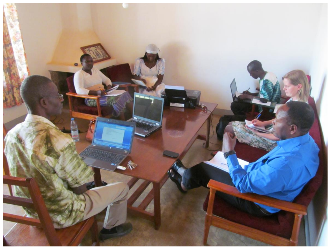
Photo of an evaluation planning session conducted between the evaluators, PLS staff and NMS

Our sincere appreciation goes to the evaluation planning and coordination team that comprised of NMS and its representative in Cameroon, EELC Church Leadership, PLS and other staff at EELC for facilitating our work and enabling successful completion of this evaluation. Special thanks also go to all members of the support groups and their leadership, members of the youth mobile caravan, Government officials and everyone who took their time to participate and made valuable contributions to this evaluation process. We thank you.