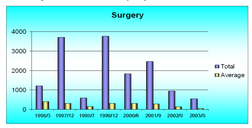
Fig. 3: Total minor and major operations 1996 – 2003

regions reduces the patient flow to Maidema. This is a dubious and unconfirmed conclusion, and the graph must therefore be used with some caution.