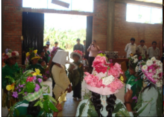
Environmental Play-Los Andes Male and Female Children