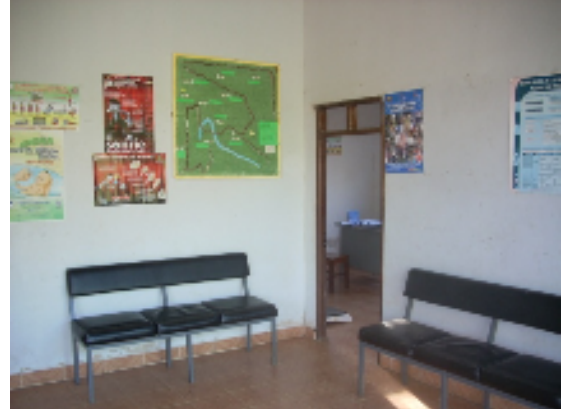
Health Post Third Elevation