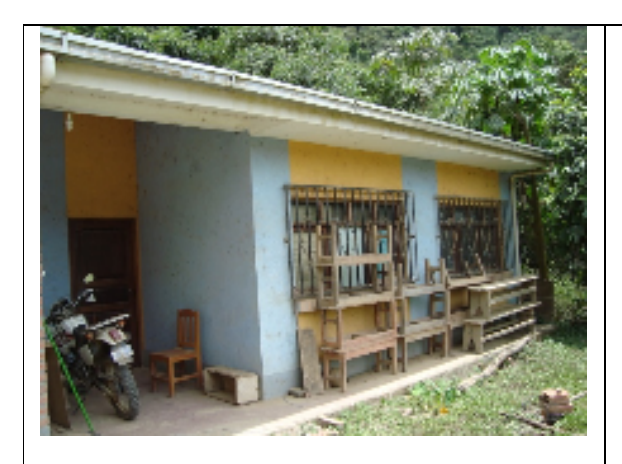
Housing for the Health Operator, Colonia San Lorenzo, Canton San Lorenzo