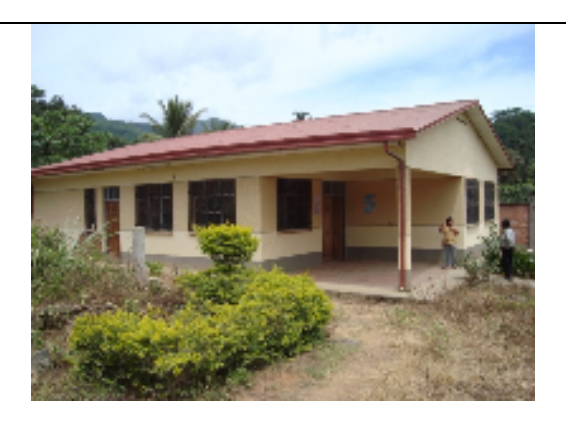
Lateral view of Santa Fé Health Center