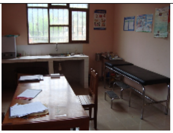
Indoors view of Santa Fe Health Center