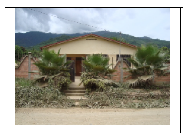
Front view of Santa Fé Health Center