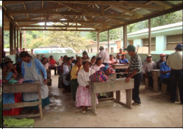
Community Meeting in Espíritu Santo