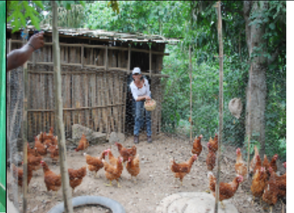
Coop -Santa Fe