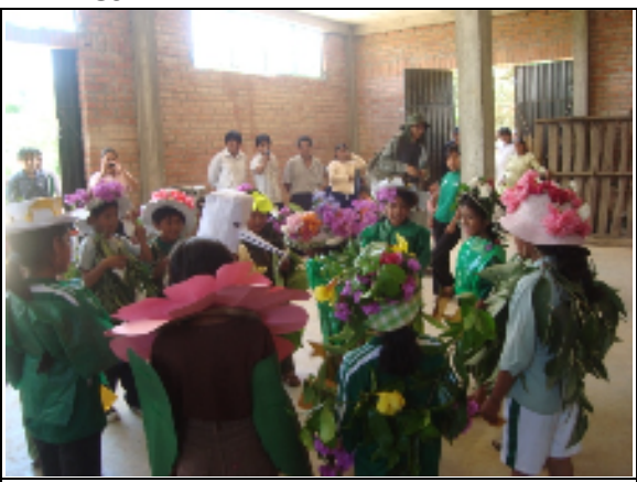
Environmental play- Los Andes Male and Female Children