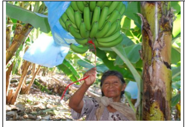
Banana Producer-V. Elevación