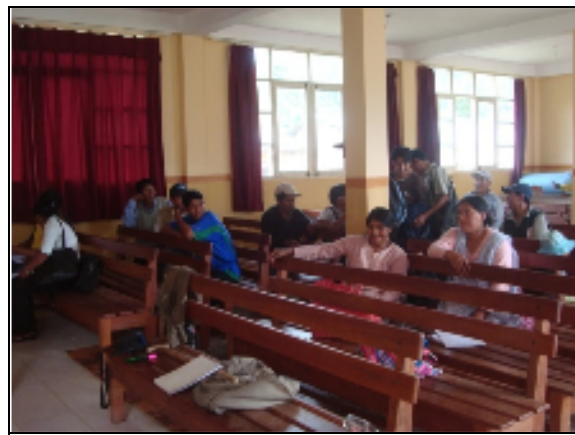
Group of producers Association Oro Verde- Alto Lima